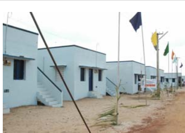
50 Houses Constructed by Guru Nanak Sarbat Sikh Sangat for Tsunami Affected people at Muzhukkuthurai village in Killai Taluka, Cuddalore District, Tamil Nadu, India.

An umbrella organization was formed and named as “ Guru Nanak Sarbat Sikh Sangat ” to reflect the commonality of all organizations involved in the welfare of humanity. The representatives from various organizations committed funds on behalf of their organizations and a core committee was formed to implement the project. This committee worked closely with the district administration to identify and procure land for the project. The Leprosy Mission also joined in and the scope of the project was expanded to include a Community Hall and a Medical Centre also. Further, some more land was purchased and the area of each individual plot was increased from the government recommended size of 3 cents to 5 cents, making this colony one of the most spacious and well-planned rehabilitation projects.