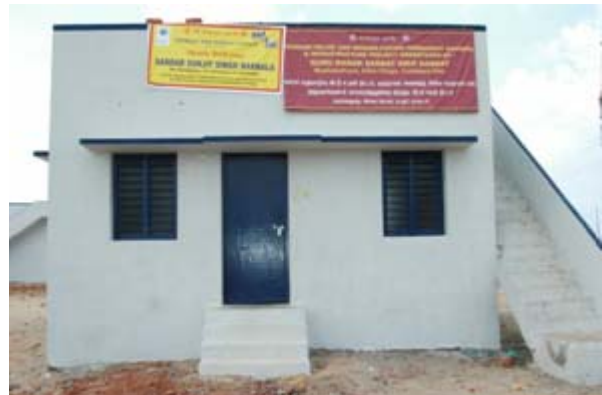
Complete Constructed House by Guru Nanak Sarbat Sikh Sangat