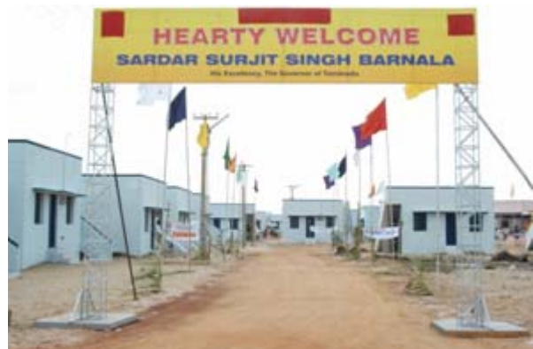
Entrance for houses constructed